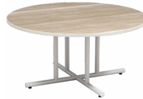
Round 4 X-Base M4X36-C0054-29