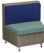
DUO-L35 Left Miter