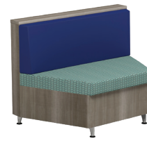
DUO-RL45 Double Miter