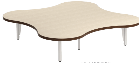
RFJ-C6060CL Clover Shape