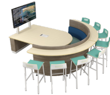
(2) PKT-QR90-CCL shown with Bella Stools, Crayon Table and TV Monitor. *TV not included.