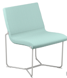
FRM-NW68E13S One Seater Mid Back