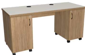
Cupboard Storage Right & Left STD-C2460_-CSR/CSL-29 STD-C3060_-CSR/CSL-29 24"/30"D x 60"W x 29"H