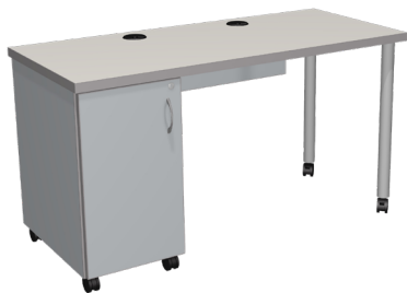
Cupboard Storage Left STD-C2454_-CSL-29 STD-C3054_-CSL-29 24"/30"D x 54"W x 29"H