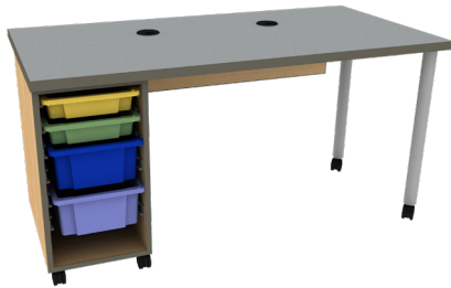
Toto Totes STD-C2454_-TOT-29 STD-C3054_-TOT-29 24"/30"D x 54"W x 29"H