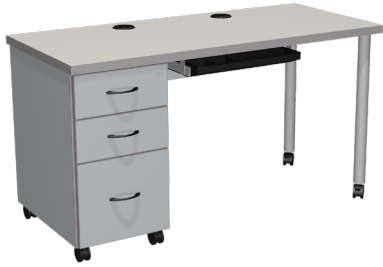
2 Box/1 File STD-C2454_-BBF-29 STD-C3054_-BBF-29 24"/30"D x 54"W x 29"H