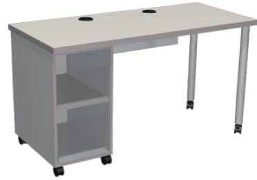
Open Storage STD-C2454_-OS-29 STD-C3054_-OS-29 24"/30"D x 54"W x 29"H