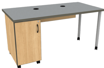
Cupboard Storage Left STD-C2460_-CSL-29 STD-C3060_-CSL-29 24"/30"D x 60"W x 29"H