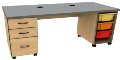
2 Box/1 File & Toto Totes STD-C2460_-BBF/TOT-29 STD-C3060_-BBF/TOT-29 24"/30"D x 60"W x 29"H