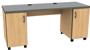
Cupboard Storage Right STD-C2466T-CSR/CSL-29 STD-C3066T-CSR/CSL-29 24"/30"D x 66"W x 29"H

Note: Units are non-handed. Which side receives the storage or legs can be decided at installation or changed at users discretion.