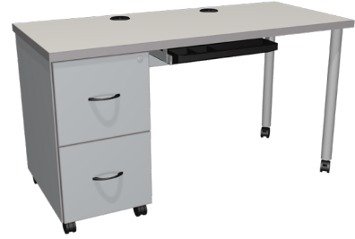
2 File Drawers STD-C2454_-FF-29 STD-C3054_-FF-29 24"/30"D x 54"W x 29"H