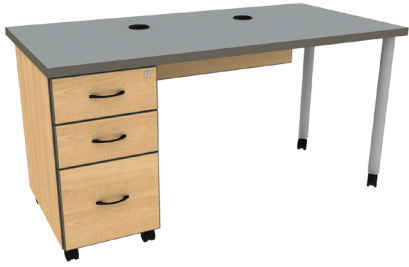
2 Box/1 File STD-C2460_-BBF-29 STD-C3060_-BBF-29 24"/30"D x 60"W x 29"H