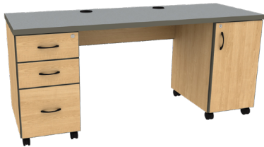
Cupboard Storage Left STD-C2466_-BBF/CSL-29 STD-C3066_-BBF/CSL-29 24"/30"D x 66"W x 29"H