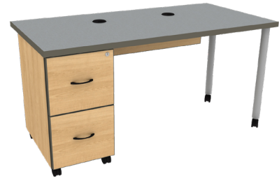
2 File Drawers STD-C2460_-FF-29 STD-C3060_-FF-29 24"/30"D x 60"W x 29"H