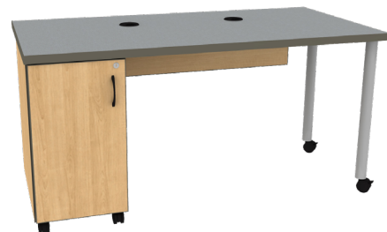
Cupboard Storage Right STD-C2460_-CSR-29 STD-C3060_-CSR-29 24"/30"D x 60"W x 29"H

Note: Units are non-handed. Which side receives the storage or legs can be decided at installation or changed at users discretion.