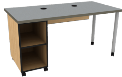
Open Storage STD-C2460_-OS-29 STD-C3060_-OS-29 24"/30"D x 60"W x 29"H