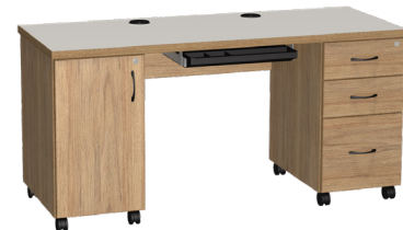
2 Box/1 File & Cupboard Storage Left STD-C2460_-BBF/CSL-29 STD-C3060_-BBF/CSL-29 24"/30"D x 60"W x 29"H