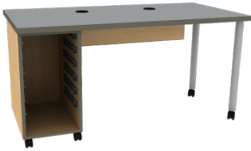
Toto Totes STD-C2466_-BBF/TOT-29 STD-C3066_-BBF/TOT-29 24"/30"D x 66"W x 29"H