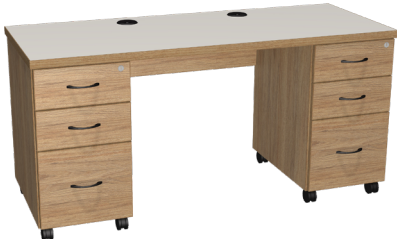
2 Box/1 File on both sides STD-C2460_-BBF/BBF-29 STD-C3060_-BBF/BBF-29 24"/30"D x 60"W x 29"H