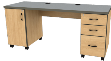
Cupboard Storage Right STD-C2466_-BBF/CSR-29 STD-C3066_-BBF/CSR-29 24"/30"D x 66"W x 29"H