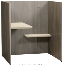
CAB-C3844LL Single Cabana Privacy Cubicle