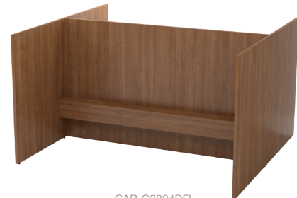
CAB-C3884DFL Double-Wide, Double-Faced Cabana Privacy Cubicle