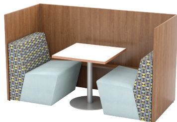
Double-Wide Cabana Privacy Cubicle CAB-C3884L in a Face-to-Face Kit with (2) WNK-3030s and (1) Orbit O17-C3030-29 Table