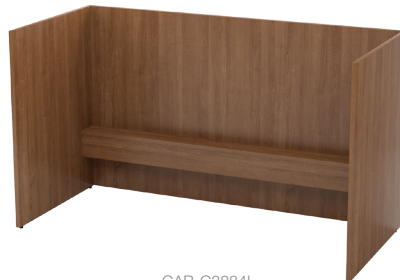
CAB-C3884L Double-Wide Cabana Privacy Cubicle