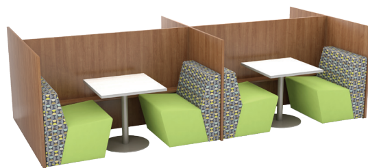
Double-Wide, Double-Faced Cabana Privacy Cubicle CAB-C3884DFL Starter and CAB-C3884DFLA Adder unit shown in a Face-to-Face Kit with (8) WNK-3030s and (4) Orbit O17-C3030-29 Tables

*All Seating and Tables sold separately.