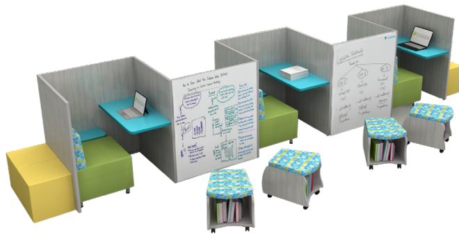
Zig Zag Cabana Privacy Cubicle Kit CAB-Z5-C3844L with Full Time Halfbacks FTSB2-24