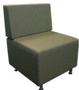
Full Time Halfback FTSB2-24