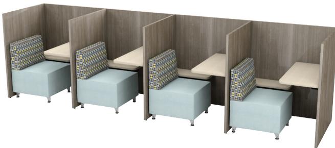
Cabana CAB-C3844LR Starter and (3) CAB-C3844LRA Adder Units with (4) Full Time Halfbacks FTSB2-24

* Also available in 2, 3, and 4 configurations