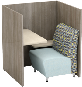
Single Cabana Privacy Cubicle CAB-C3844LL with ENA-2529