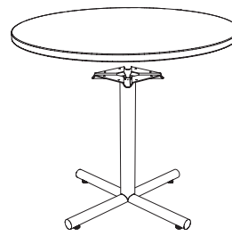
(MX) X-base - Single Column

Finishes: See mediatechnologies Finish and Color Guide at mediatechnologies.com